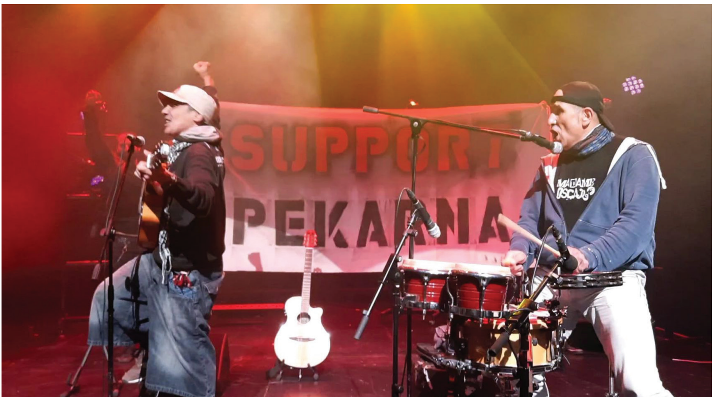
Manu Chao in September 2022 in Maribor

In 2010, in the light of the threat of closure of Pekarna by the then mayor of the city, Franc Kangler, the collectives in Pekarna, in cooperation with organisations from the Trans Europe Halles network of independent European cultural centres, organised the international conference New Times