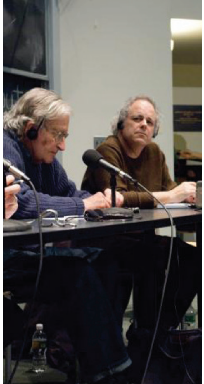
Noam Chomsky and Michael Albert at the Building a Society from Below at MIT

Similarly, regarding the then rampant emphasis on the "primary contradiction" approach for creating organization and program, I decided folks taking that type stance were wrong. It polarized constituencies, It didn't correspond to reality. It made no strategic sense, Just as one could view society with lenses attuned mainly to class, one could also view it with lenses attuned mainly to gender, race, power, international relations, or ecology. Each "monist" approach made some sense. Each would reveal some truths. But each would also miss other truths. On further examination, I decided the various oppressive phenomena of society were all entwined and even mutually constructive, or, in more modern terms, they intersected.